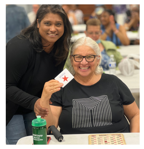
At a custom event, Macy's hosted bingo for our members and generously provided Macy's gift cards for the winners.

Hours and Location : Time commitment is flexible and location is to be determined.