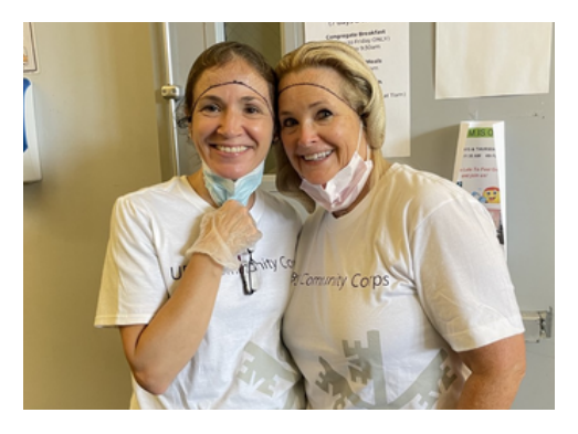
Each year, the Carter Burden Network works with hundreds of corporate volunteers who share in our dedication to ensuring that older people live safely and with dignity.

instagram.com/carterburdennetworkinkedin.com/company/carterburdennetwork